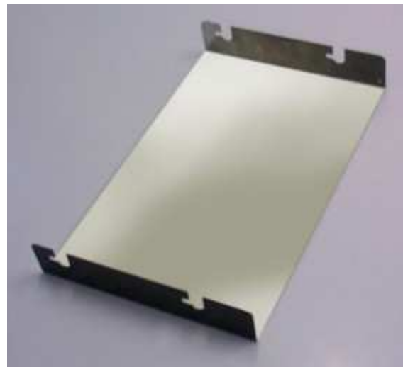
Model Shown: KC14MM