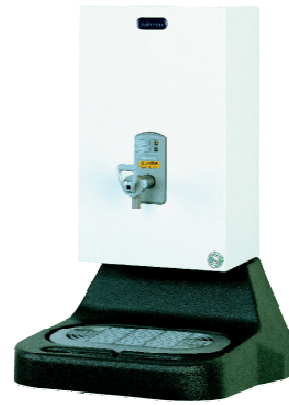
(WMDT1K shown fitted beneath a 5L)