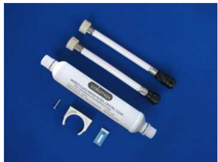
Model Shown: 10TOSCK

Important: When fitting a Granulated Activated Carbon (GAC) filter, 20 litres of water must be flushed through before commissioning