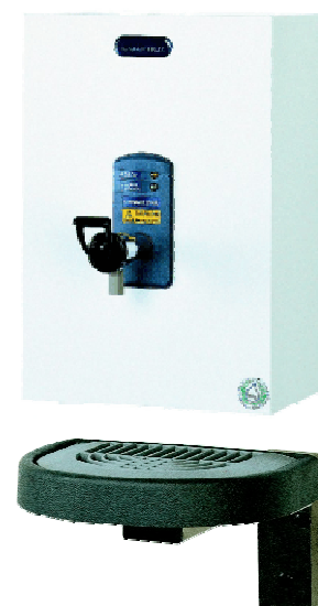
(WMPDTK1 shown fitted beneath a Compact)